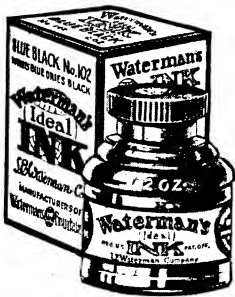
No. 102, 2 oz. Blue Black

In addition to the individual desk size containers with special features described above, the regular 2-ounce containers, packed in a square, protective carton, can be had with any of the colors of Waterman's Inks listed below.